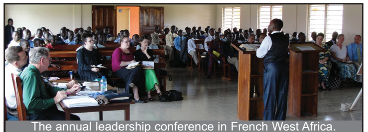
The annual leadership conference in French West Africa.